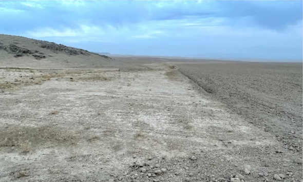
Figure 2: Project Site Area (left) and Route of Overhead Line (right)