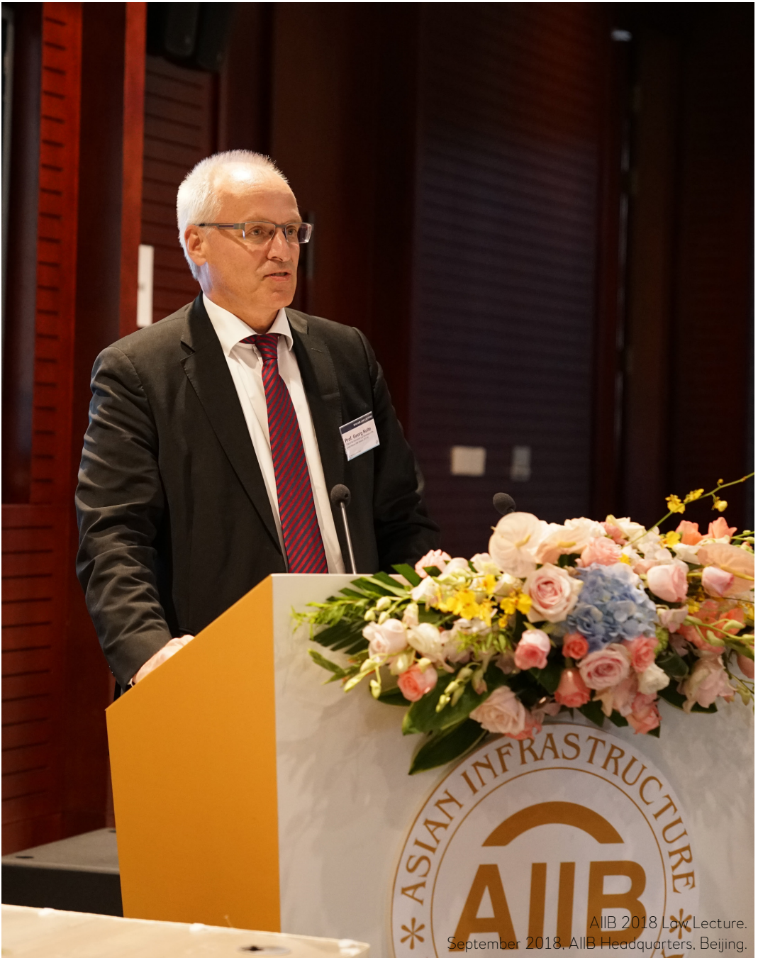
AIIB 2018 Low Lecture. September 2018, AIIB Headquarters, Beijing.