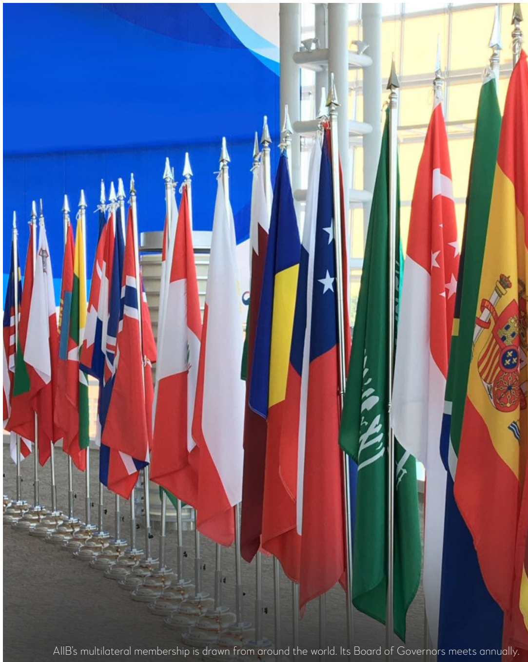
AIIB's multilateral membership is drawn from around the world. Its Board of Governors meets annually.