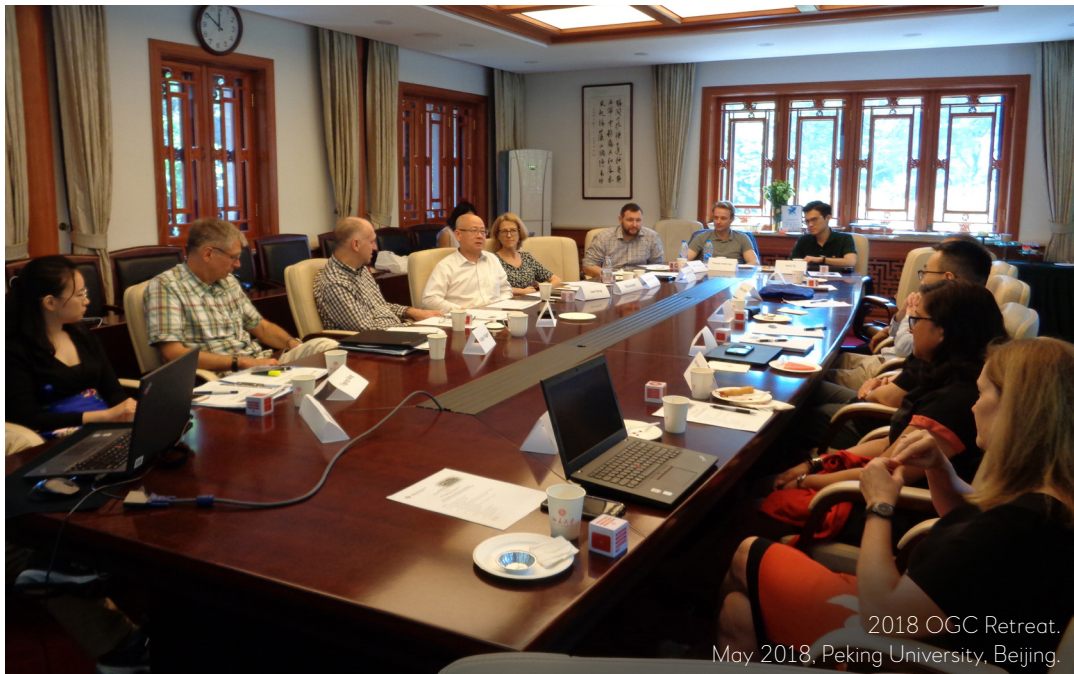
2018 OGC Retreat. May 2018, Peking University, Beijing.