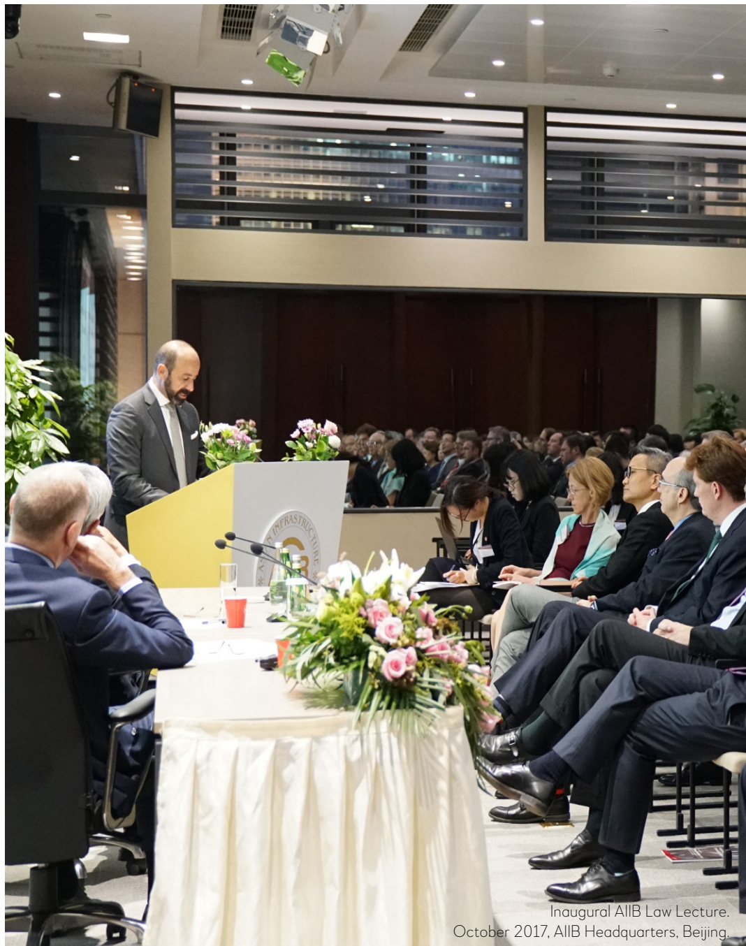
Inaugural AIIB Law Lecture. October 2017, AIIB Headquarters, Beijing.