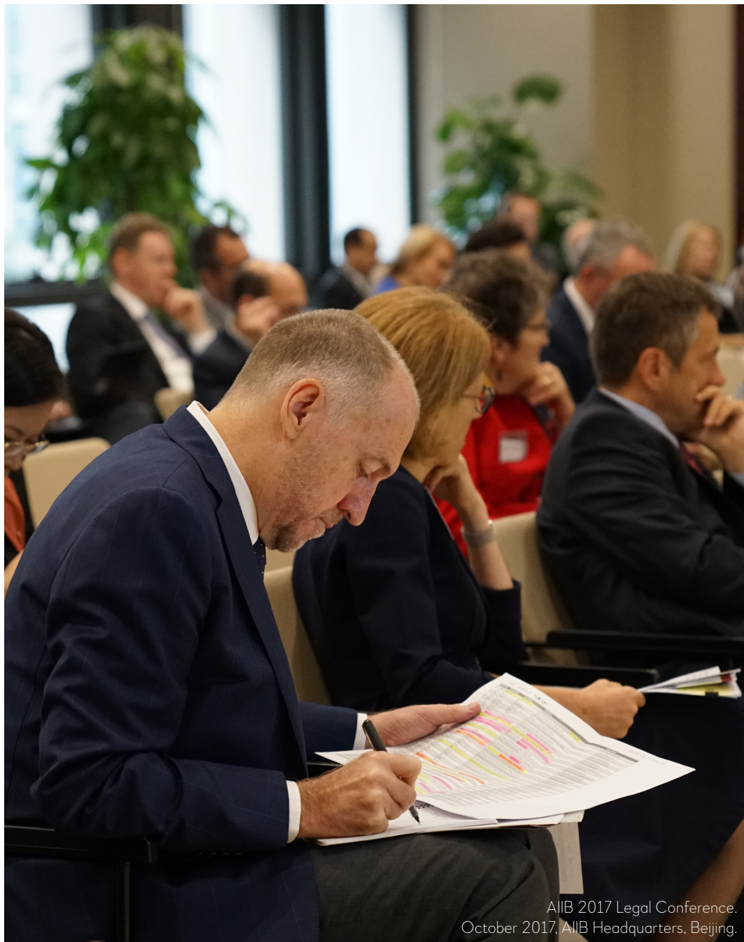
AIIB 2017 Legal Conference. October 2017, AIIB Headquarters, Beijing.