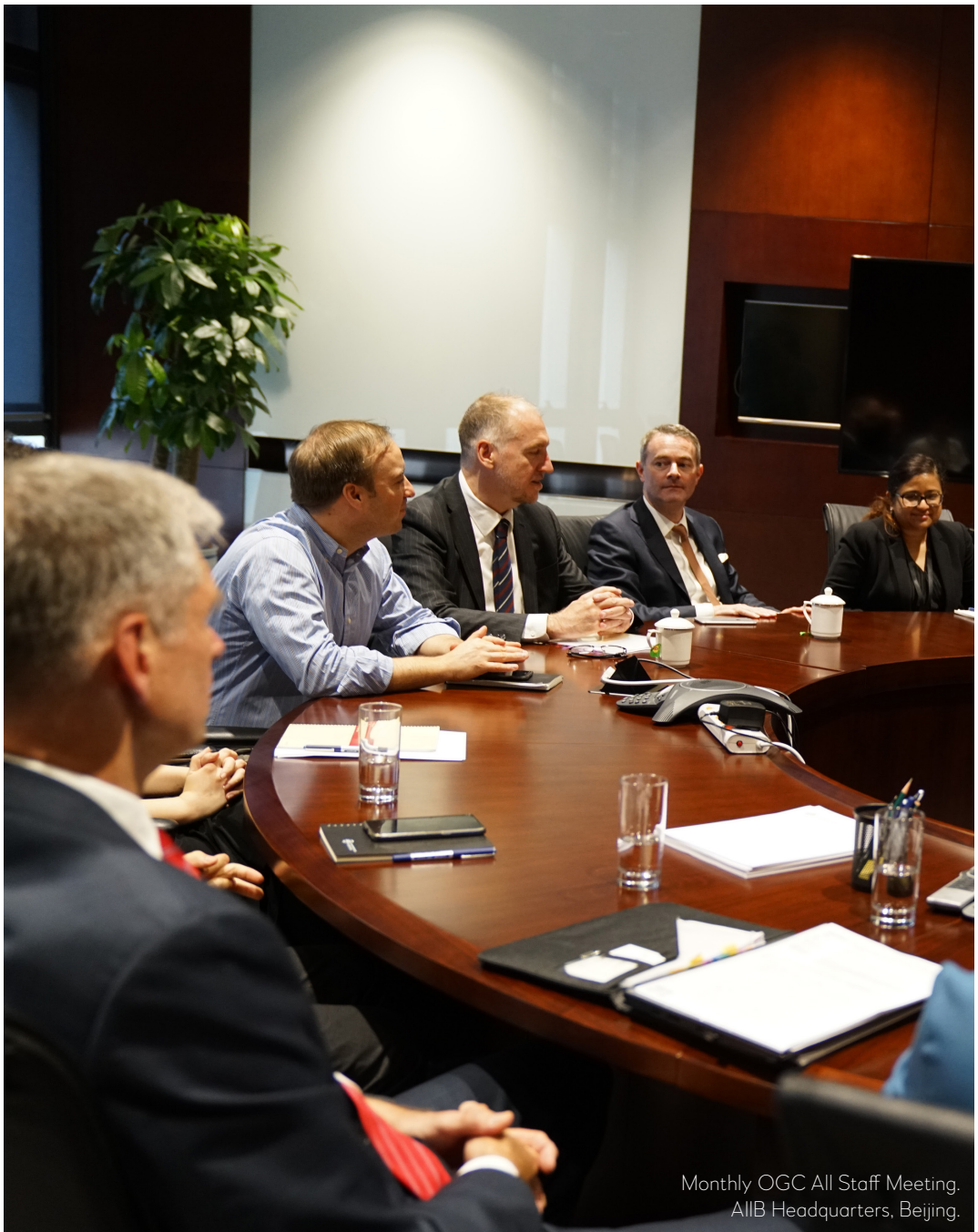
Monthly OGC All Staff Meeting. AIIB Headquarters, Beijing.