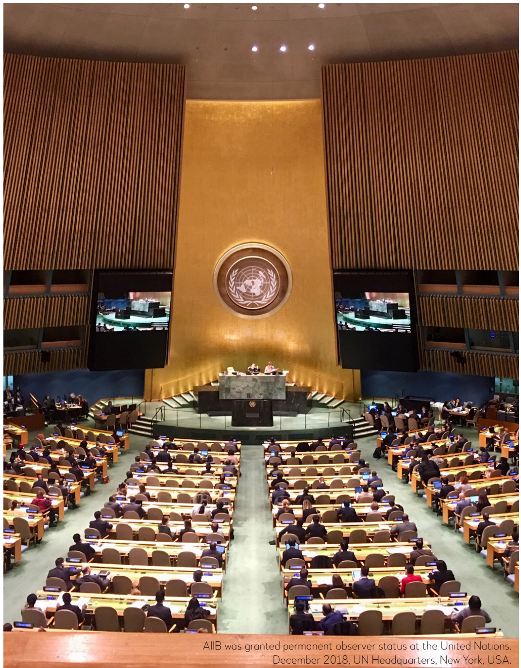
AIIB was granted permanent observer status at the United Nations. December 2018, UN Headquarters, New York, USA.